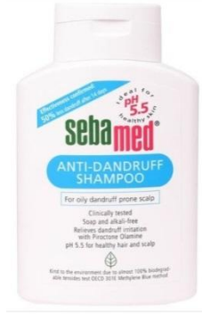
Anti-Dandruff Shampoo 200ml

Infused with a special oil-absorbing powder that helps deliver a light matte finish and also contains Vitamin B3 and moisturizing Hyaluronic Acid that help make skin healthier with regular use.