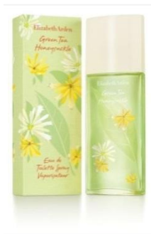
Green Tea Honeysuckle EDT Spray 30 MI