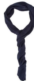
Basic Casual Shawl