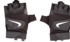
Nike Legendary Training Gloves