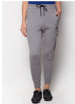
Nike Tech Fleece Pants