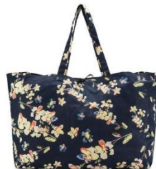
Multi Floral Shoulder Bag