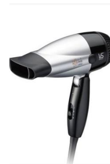
1800w Dual Ionic Shine Ceramic Compact Dryer

Peruvian Uncaria, an effective agent to fight against fat accumulation.