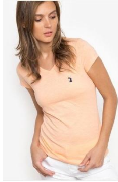
TOPS & SHIRTS