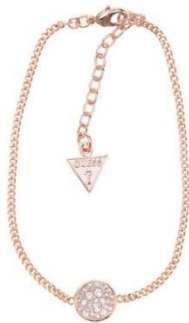
Swarovski Charm Bracelet