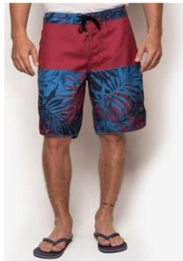
Islander Board Shorts