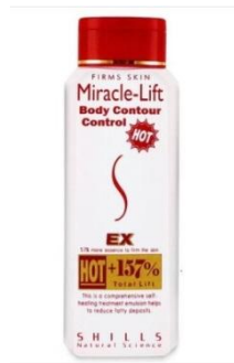
Miracle Lift +157% Body Contour Control 200ml

Notes: Irresistible blend of honeysuckle and fresh green tea leaves.