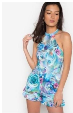
Lizzy Abstract Floral Romper