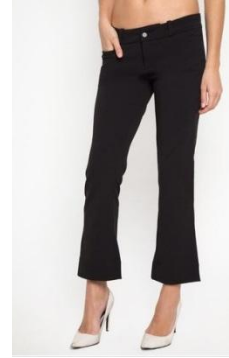
Damia Flared Skinny Pants