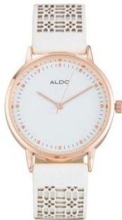
Cocciglia Analogue Watch