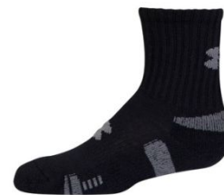
HeatGear Crew Socks Pair of 3