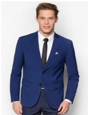
SlimFit Suit Jacket