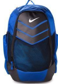
Nike Vapor Power Backpack