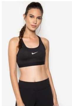
Nike Pro Classic Padded Sports Bra