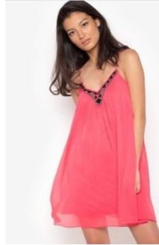
Escapade Sheer Layered Dress