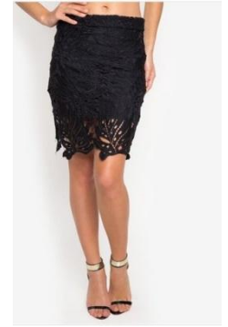
Dharma Floral Cutout Skirt