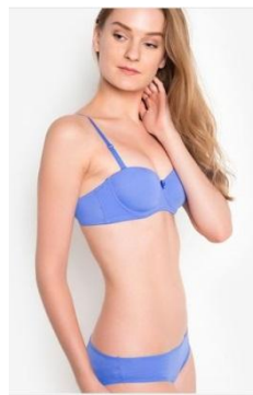
Half Cup Padded Bra