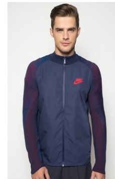
Nike Tech Knit Varsity Jacket