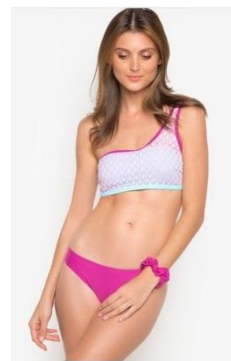
Crochet One Shoulder Bikini Set