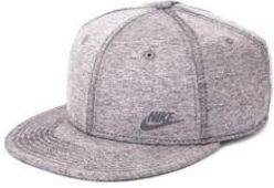
Nike Tech Pack True Red Cap