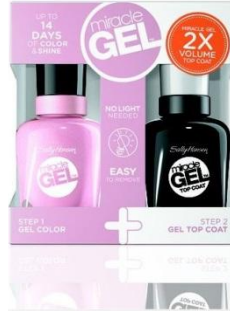
Miracle Gel Secret Garden Duos In Flower Crown