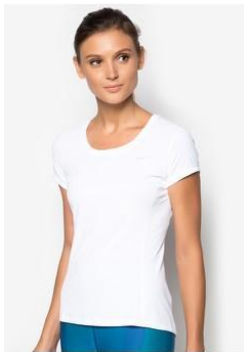
Nike Dry Contour Running Top