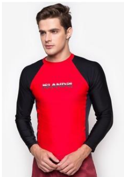
Long Sleeve Rashguard