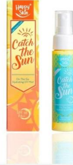
Catch The Sun On The Go Hydrating UV Mist SPF 35

This gel nail polish from Sally Hansen stays up to 14 days and can easily be removed just like ordinary nail polish. It cures in natural light thus no more UV or LED lamp needed.